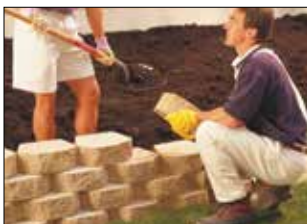
2. Place & Compact Backfill

Starting with straight areas first, begin placing the second course. Center each unit on the seams of the course below in a running bond pattern as shown. Now proceed to the next layer, backfilling as you go. For drainage behind the wall, clean gravel or crushed stone is recommended.